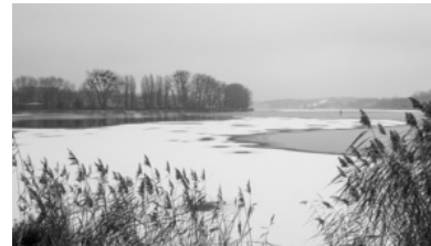
"Semi-frozen Lake Malta"

[5] Hold fast to dreams For when dreams go Life is a barren 2 field Frozen with snow